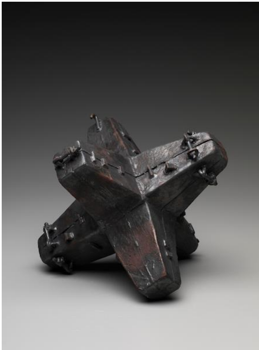
Jackstone Armature, Ceramic Stoneware, 9x9x9", 2017