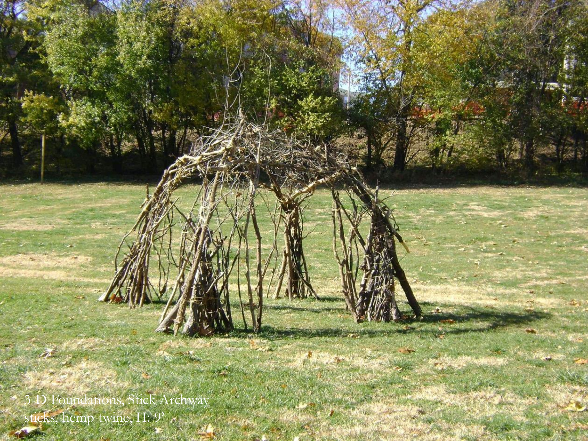
3-D Foundations, Stick Archway sticks, hemp twine, H: 9'