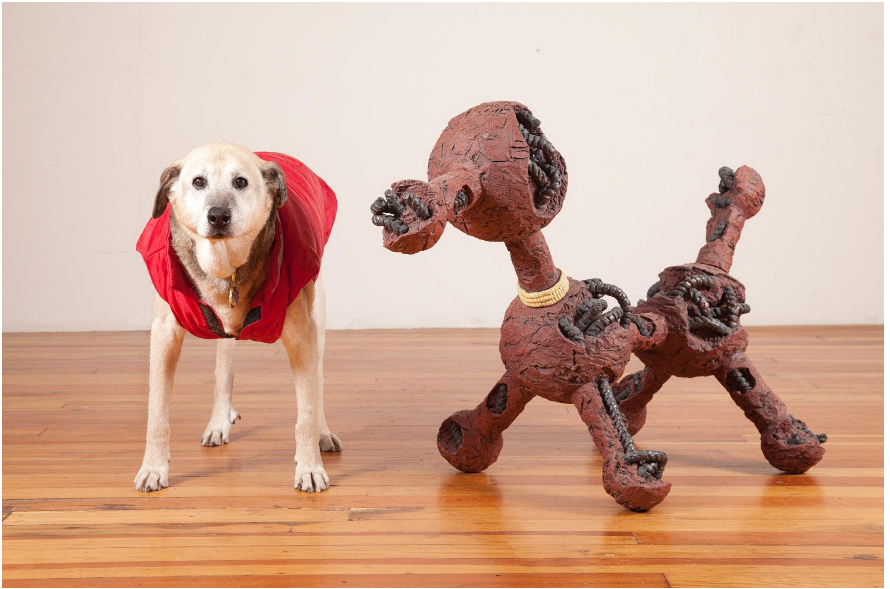
Mac and Mac the Ethanol Molecule, Ceramic Stoneware, PC-7, dog, 2013