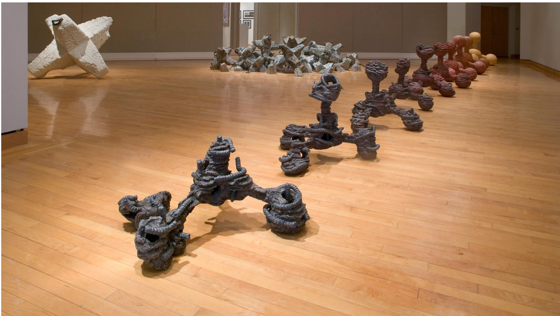
DAM Nebraska, MFA Thesis Exhibition at Bowling Green State University, 2008