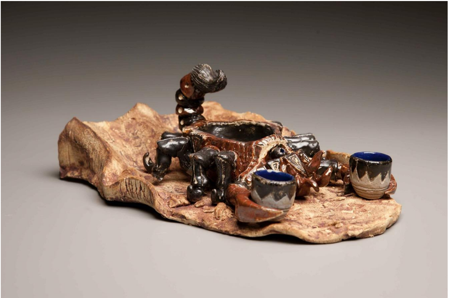
Beginning Ceramics, Serving Tray and Dishes hand-built and wheel-thrown stoneware, Gas Cone 10, W: 16"