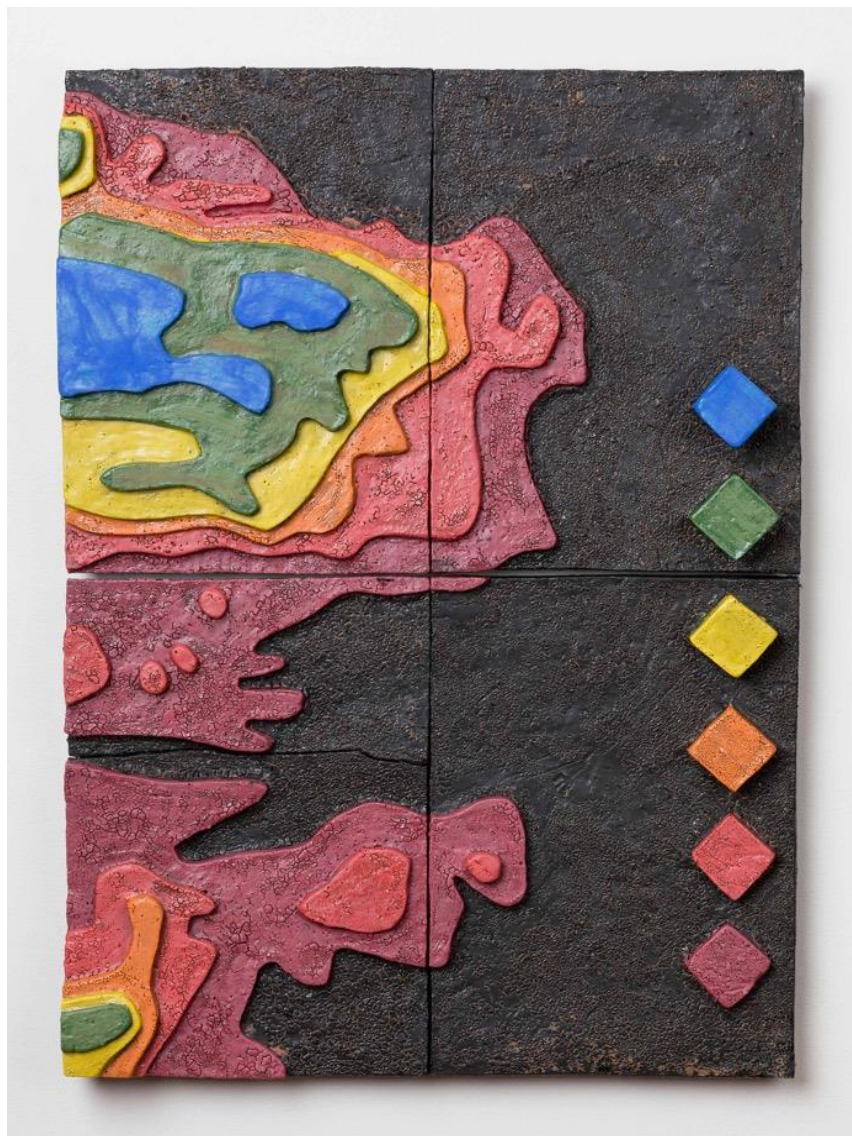
Dried Up On The Ogallala Aquifer 11, Ceramic Stoneware, plywood, vulkem, 27x20x2.75” 2020