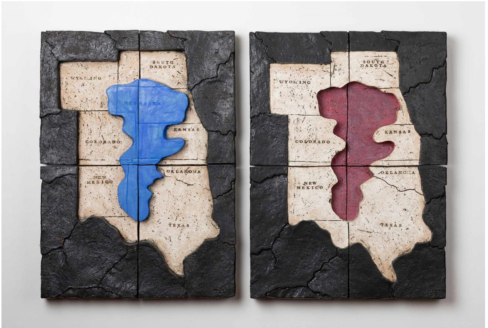
Dried Up On The Ogallala Aquifer, (Before and After), Ceramic Stoneware, plywood, vulkem, 27x42x2.75", 2020