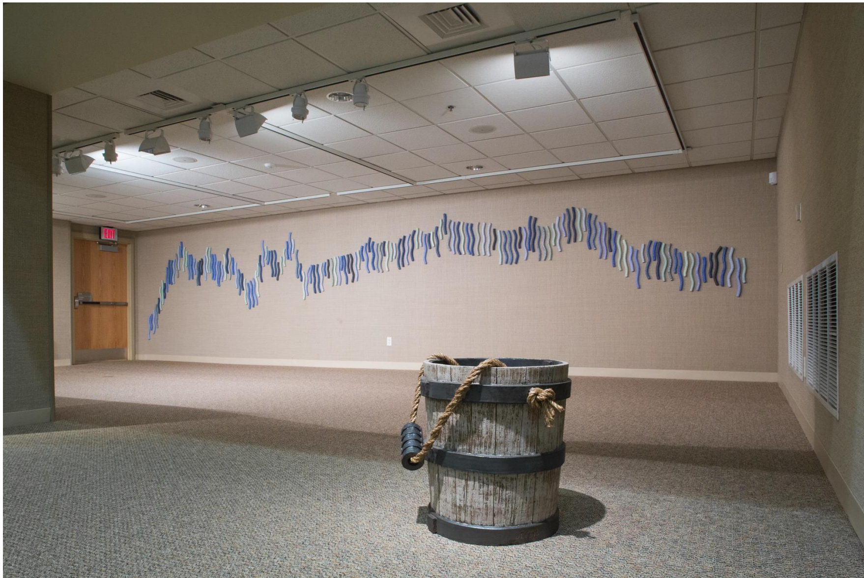
Rise and Decline of Lake Mead, Ceramic Stoneware, hemp rope, 24', 2014