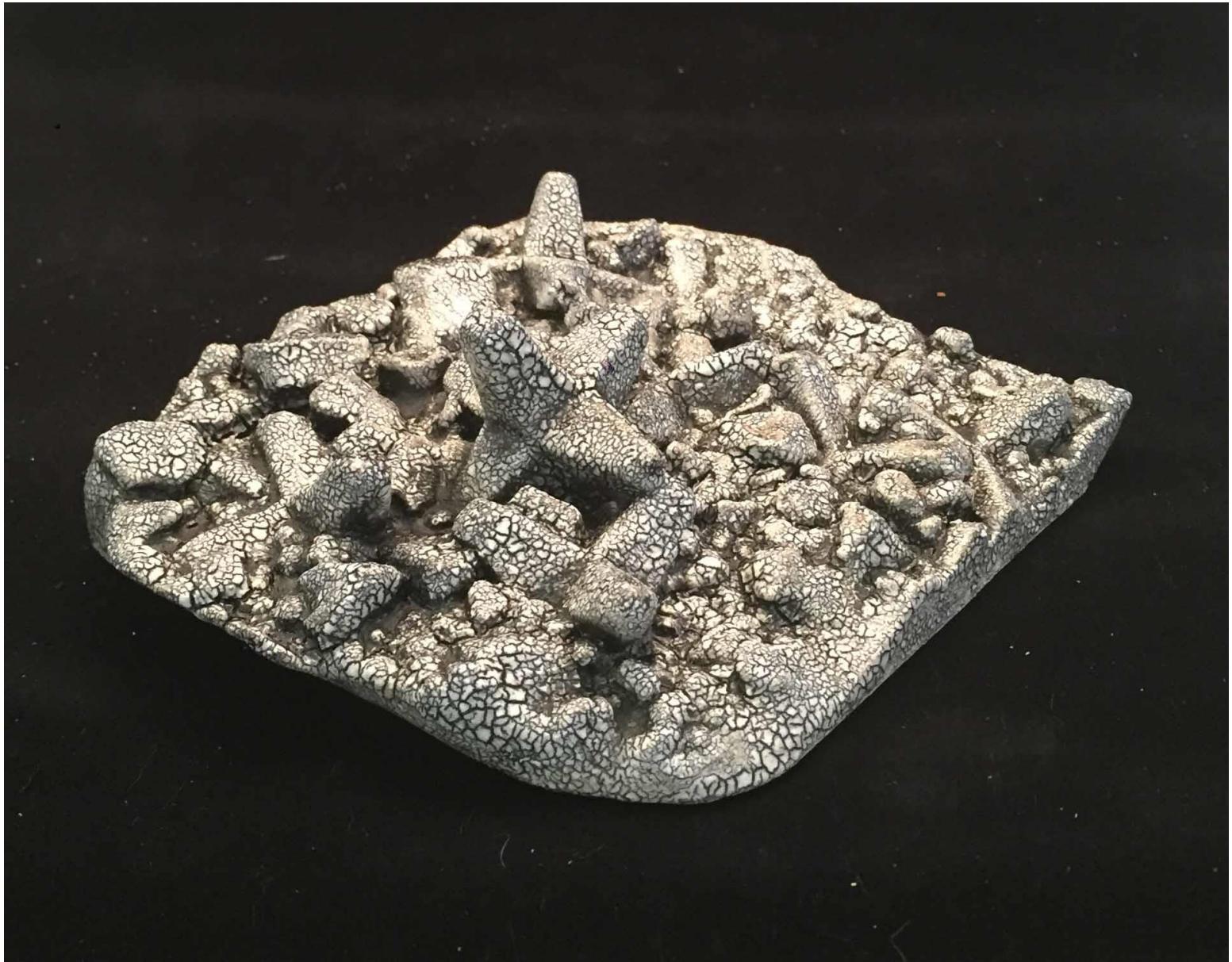
Lake McConaughy, 3-D Printed Ceramic Stoneware, 2x6x6", 2016