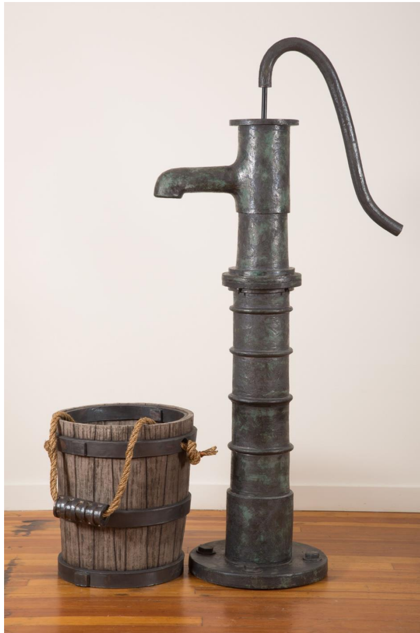
Consumption, Ceramic Stoneware, hemp rope, aluminum, bolts, 66x66x18", 2014