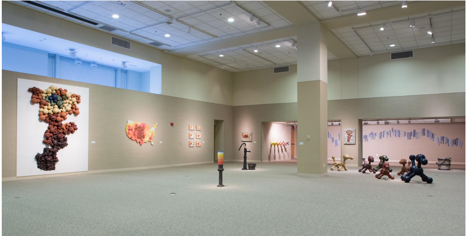
Dry Times, Great Plains Art Museum, 2014