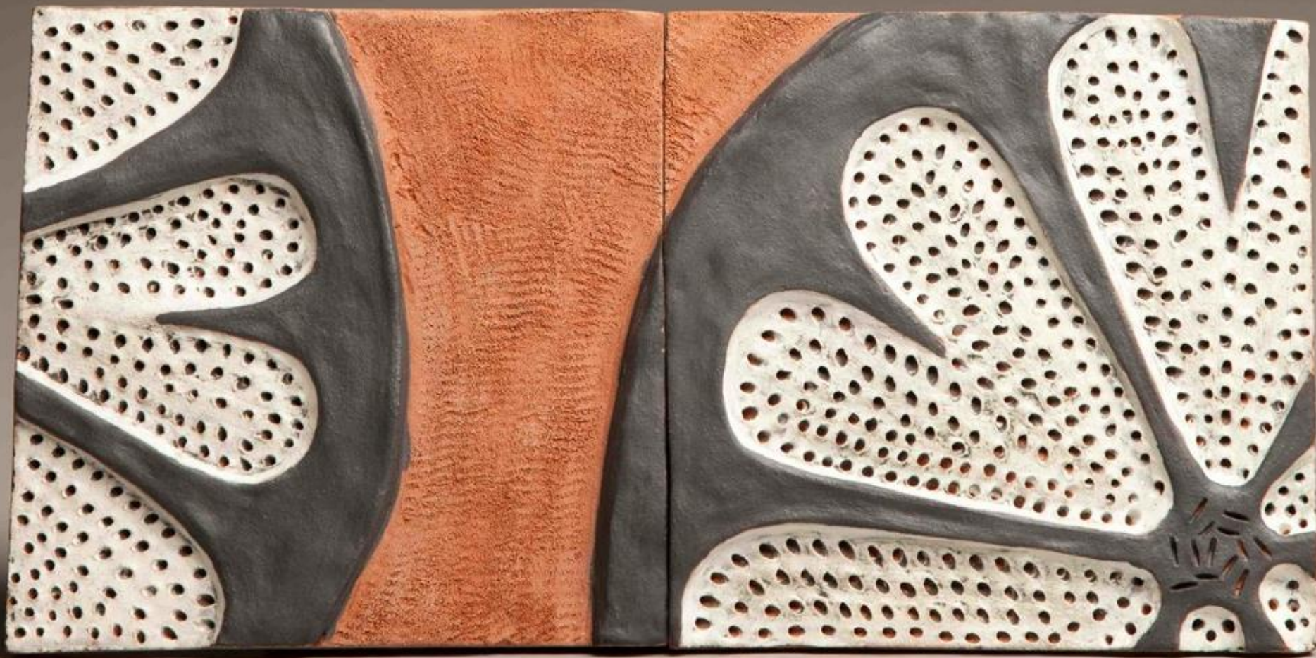
Beginning Ceramics, Diatom Tile hand-built terra cotta, Electric Cone 6, H: 7"