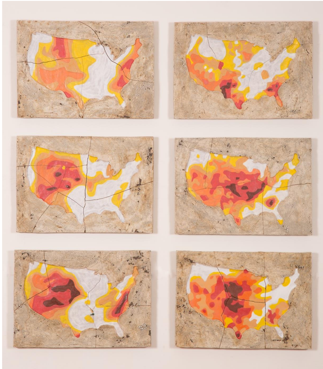
2002 vs 2012 Drought Monitor, Ceramic Stoneware, plywood, vulkem, 2012