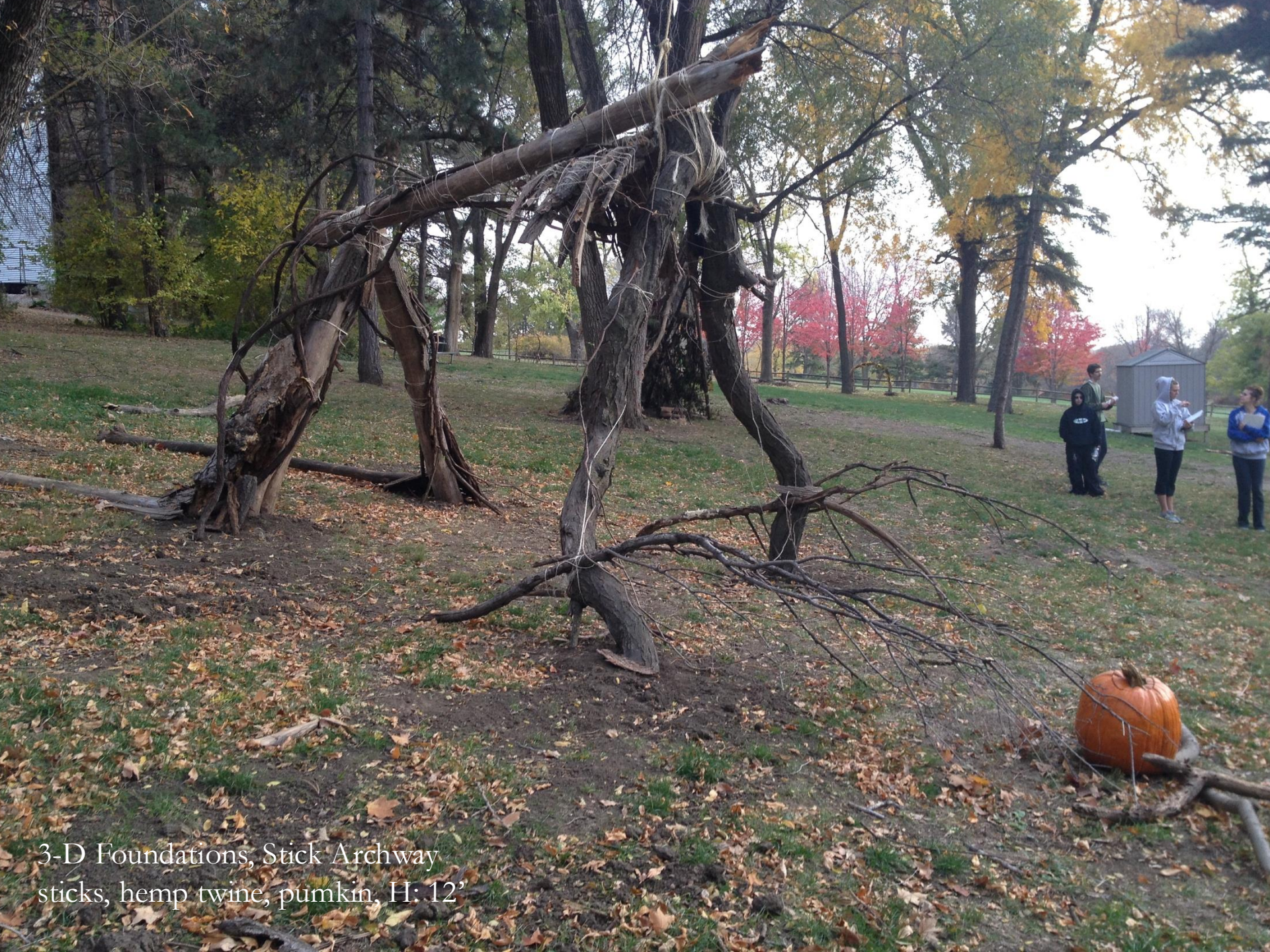
3-D Foundations, Stick Archway sticks, hemp twine, pumkin, H: 12'