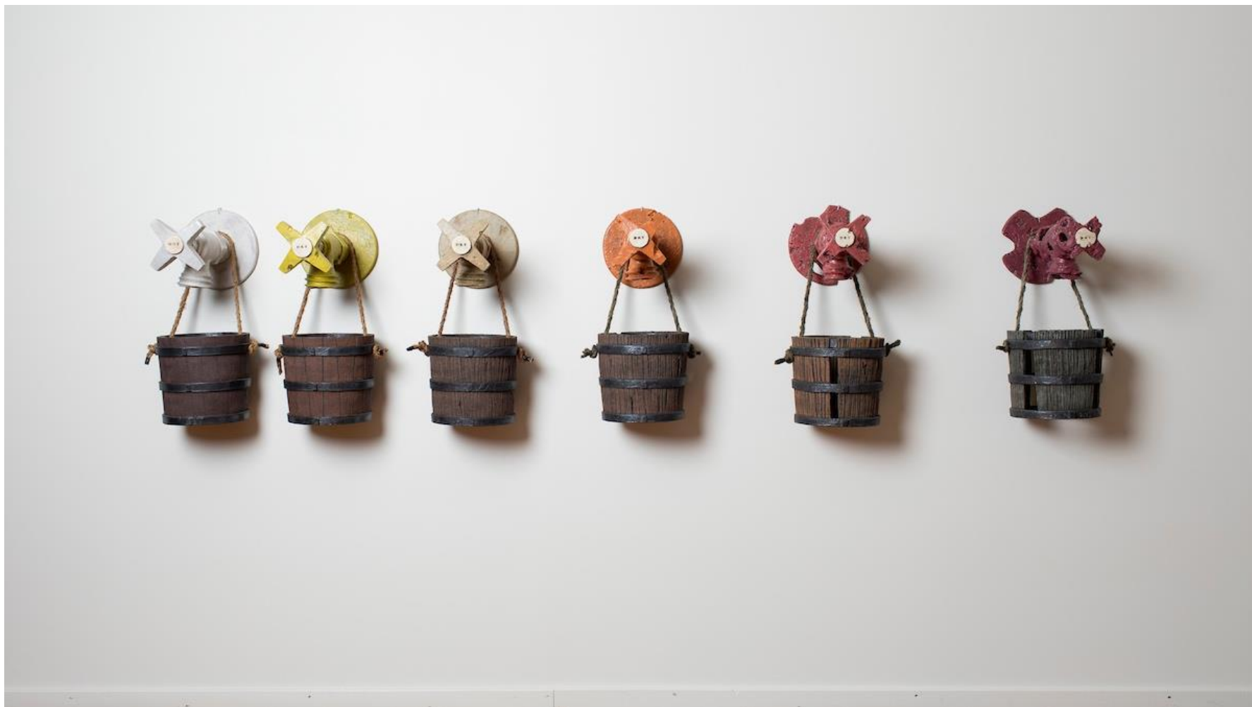
The Driest of Times, Ceramic Stoneware, hemp rope, PC-7, 68x120x16", 2018