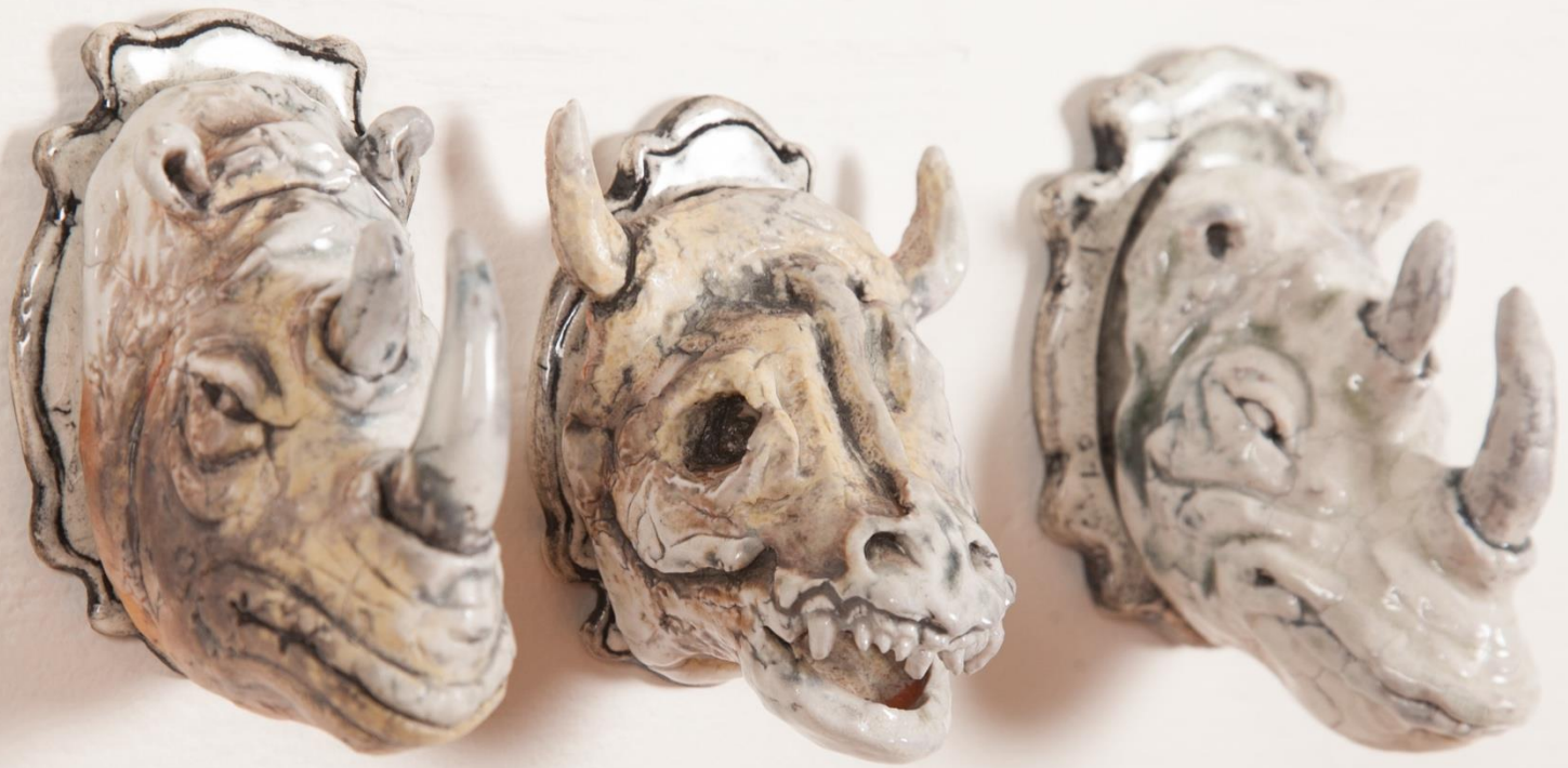
Advanced Ceramics, Wall Mounted Sculptures hand-built, porcelain, Woodfired Cone 10, H: 4"