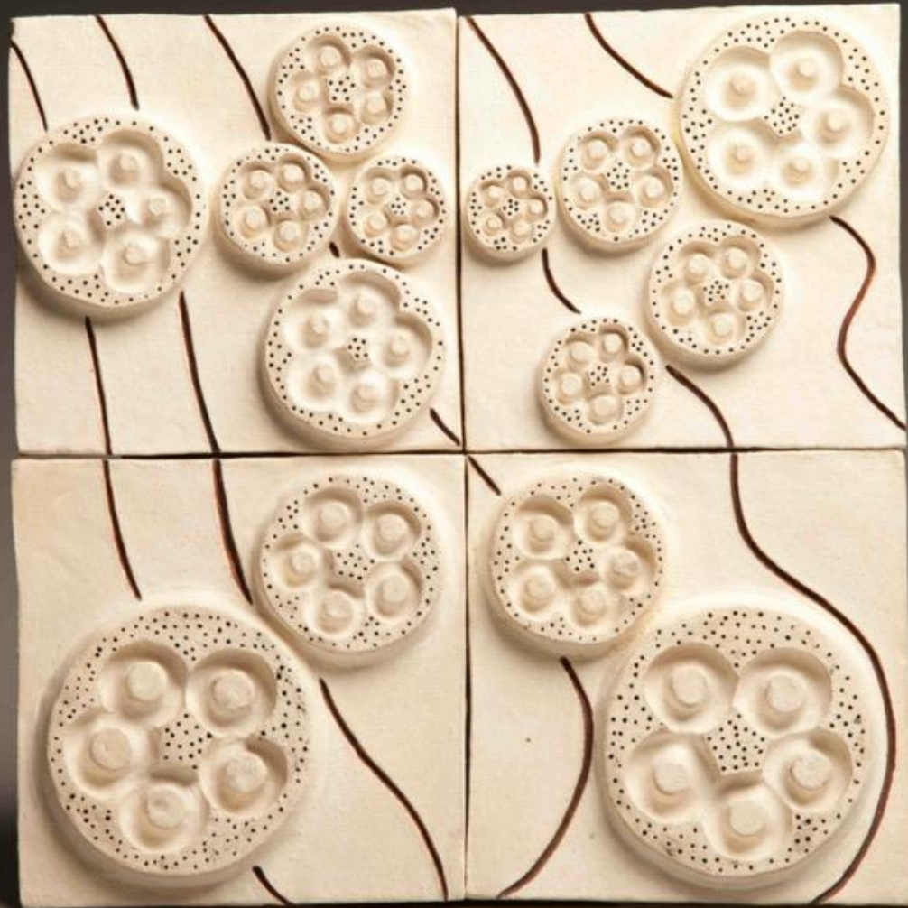
Beginning Ceramics, Diatom Tile hand-built stoneware, Gas Cone 10, H: 14"