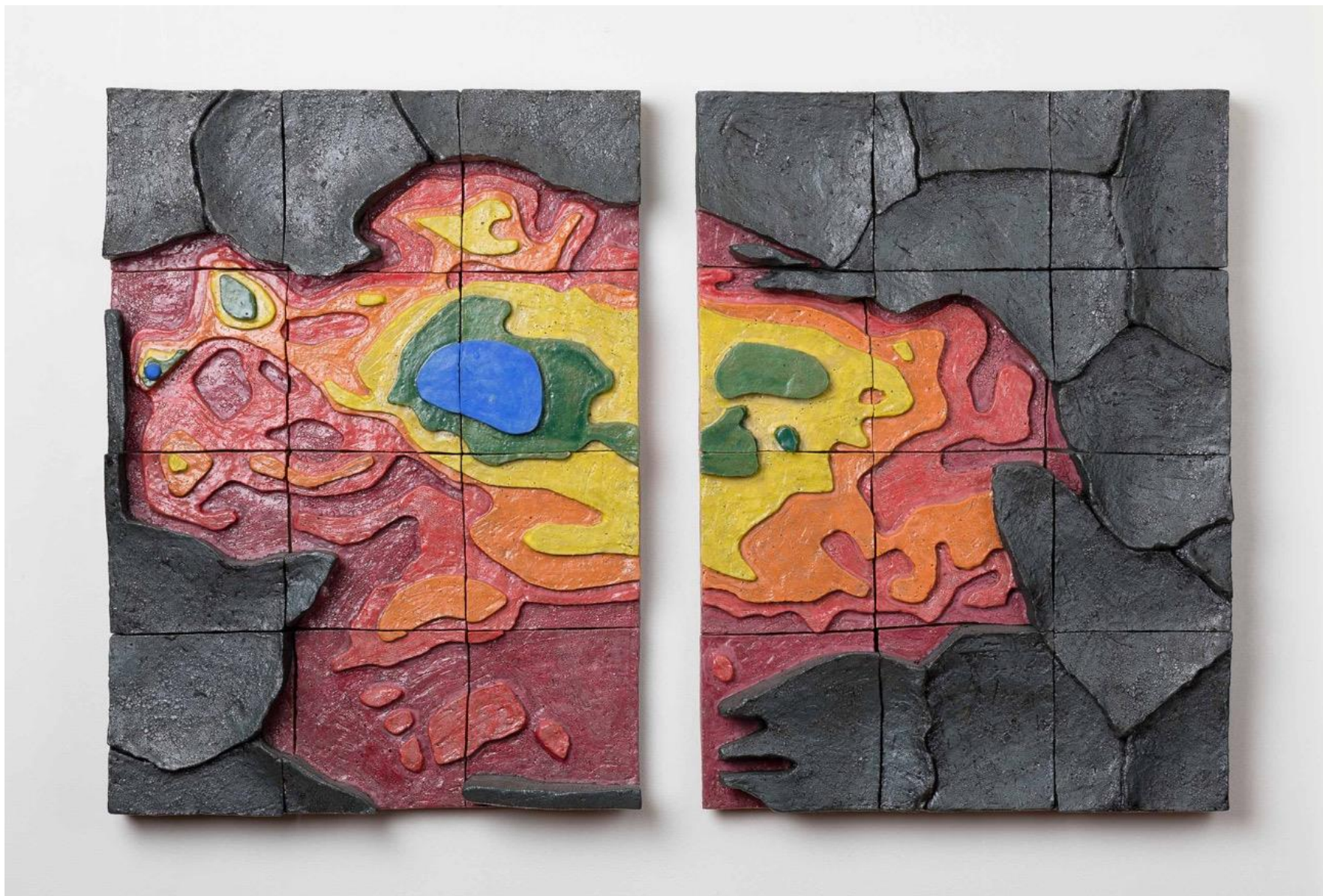
100 th Meridian Perspective, Ceramic Stoneware, plywood, vulkem, 27x42x2.75", 2020