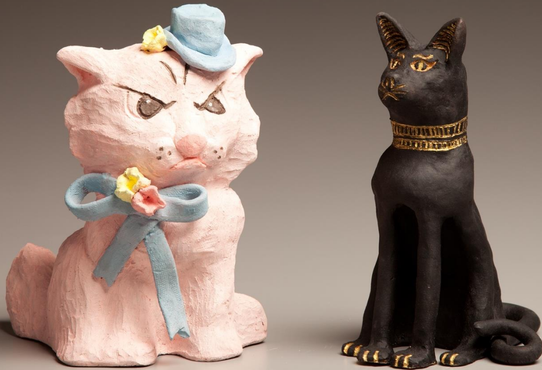
3-D Foundation, Found Object: Historical/Futuristic hand-built terracotta, paint, H: 11"