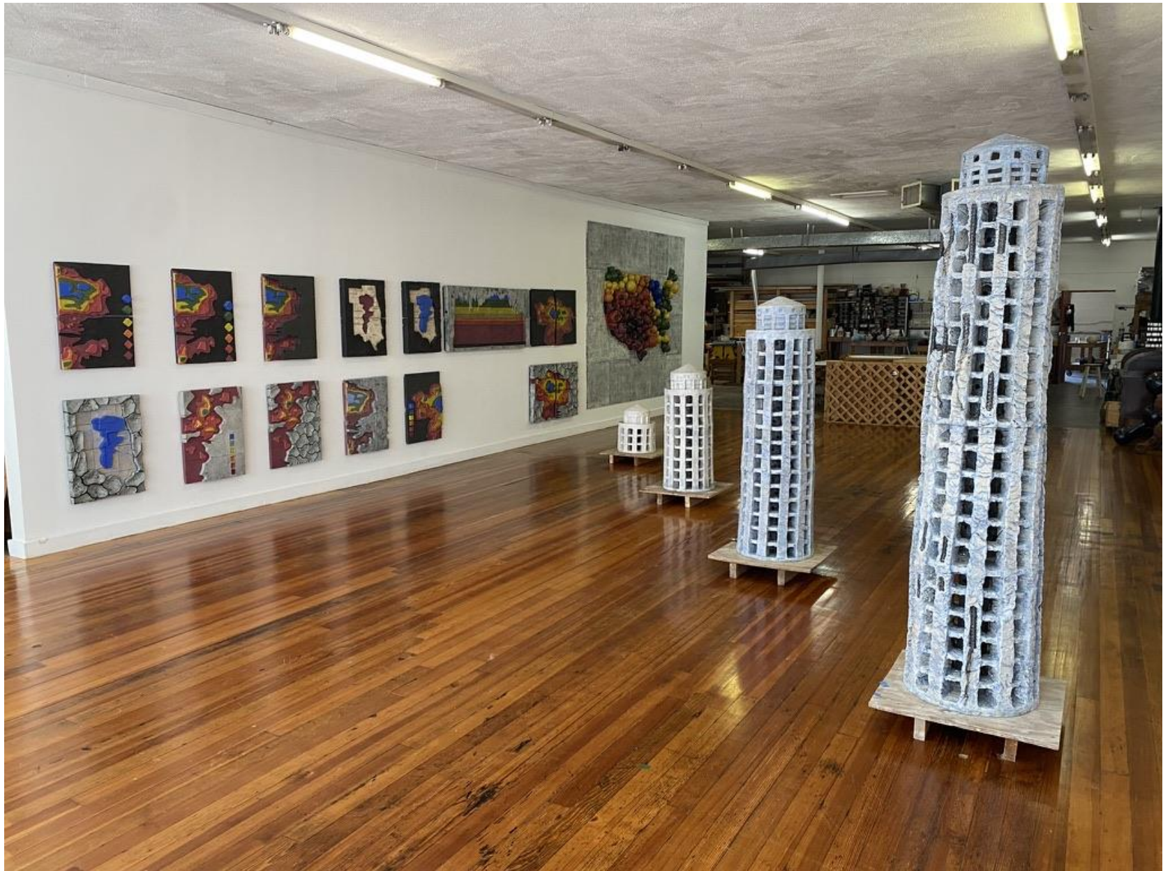
Jess Benjamin Studio, 2024