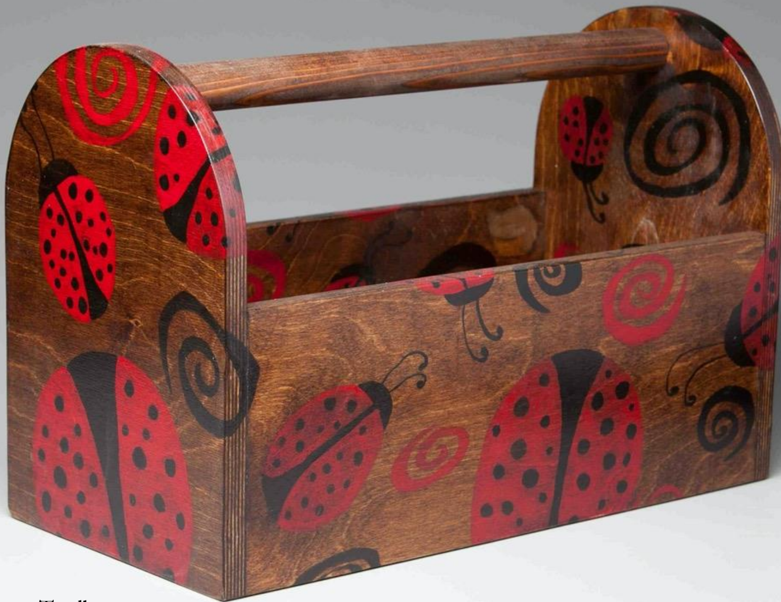
3-D Foundations, Toolbox wood, stain, paint, W: 18"