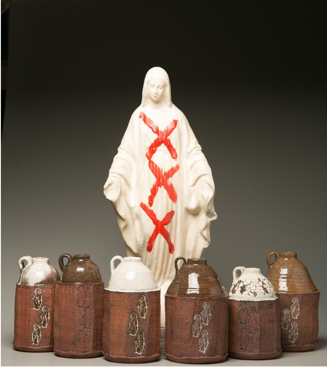
Advanced Ceramics, Molded Figure and Wheel-thrown terra cotta, Gas Cone 10 and Electric Cone 6 and Gas Cone 10, H: 30"