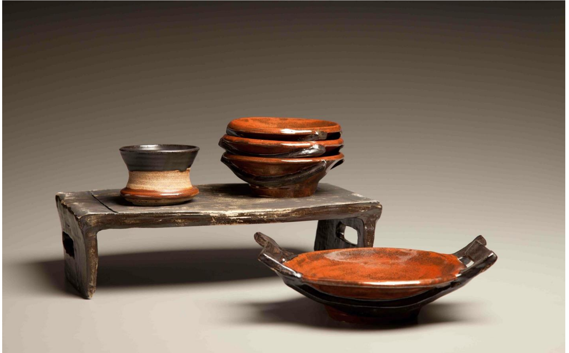
Beginning Ceramics, Serving Tray and Dishes hand-built and wheel-thrown stoneware, Gas Cone 10, W: 18"