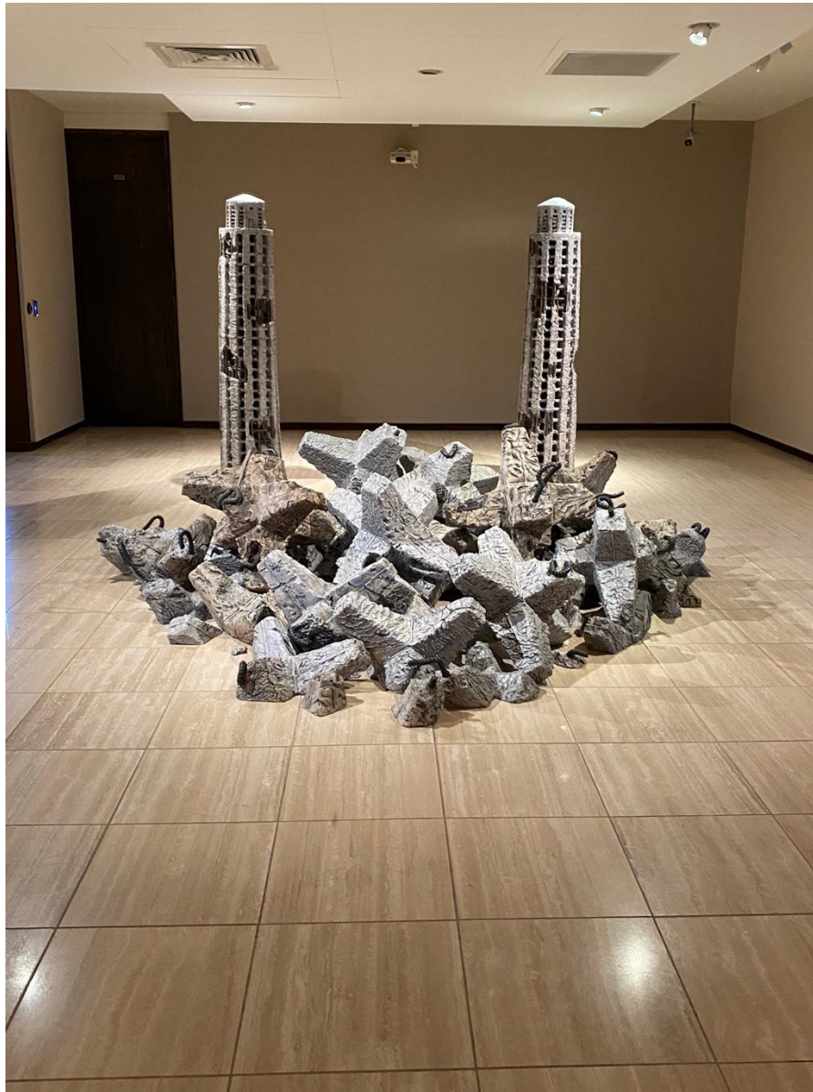
Dam Nebraska, Amarillo Museum of Art, 2021