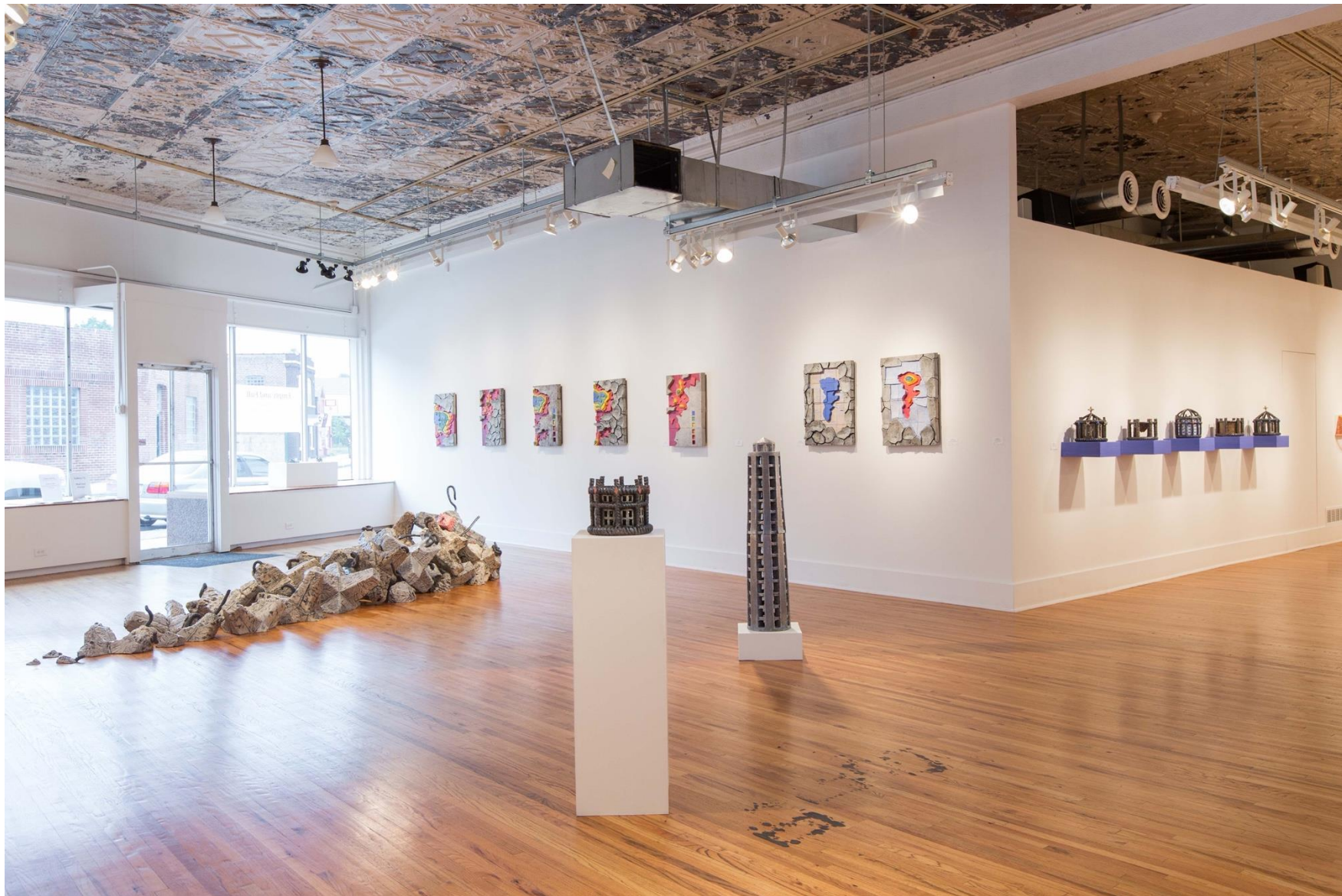
Empty and Full, Gallery 72, Ceramic Stoneware, 2016