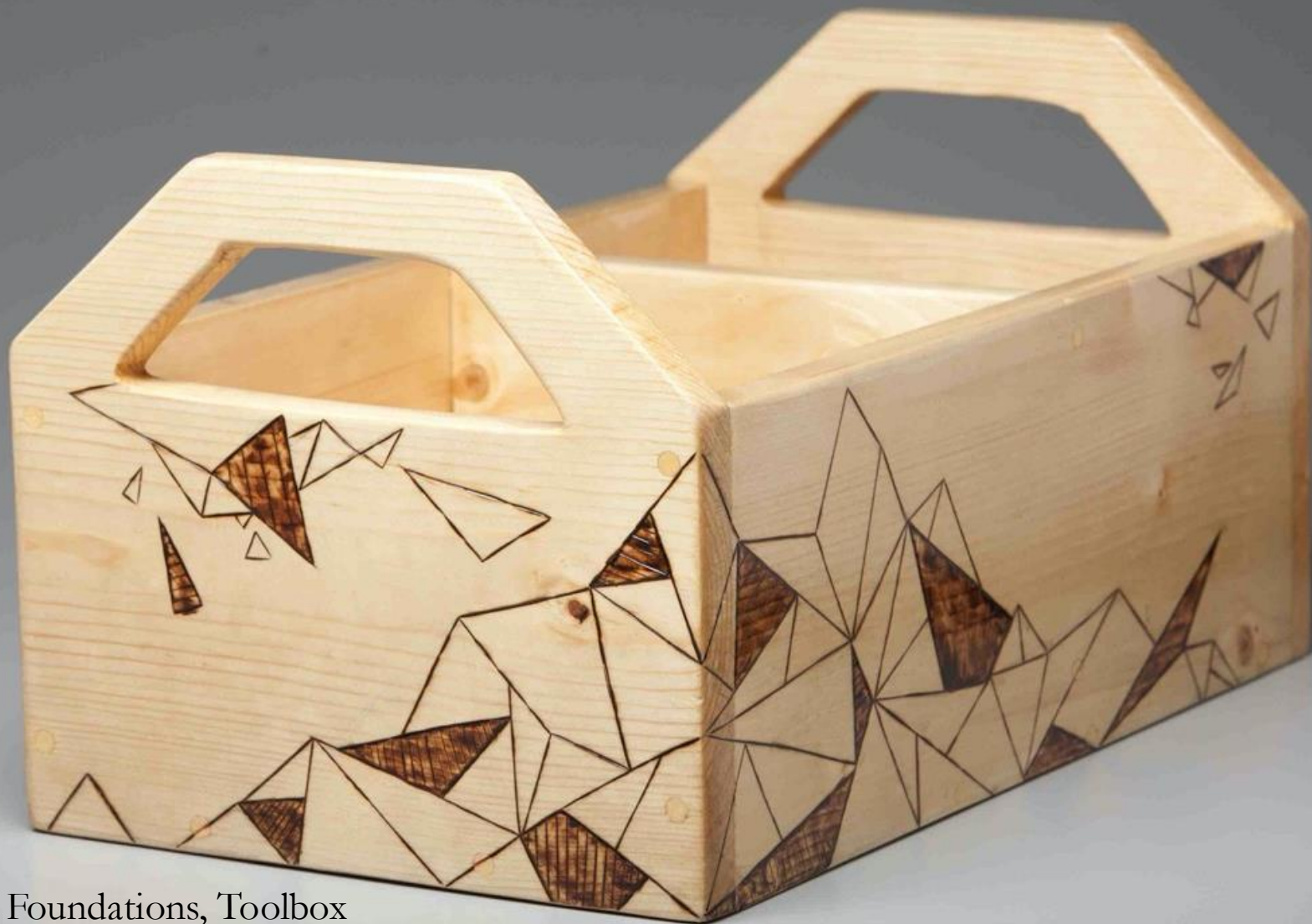
3-D Foundations, Toolbox wood, polyurethane, W: 16"