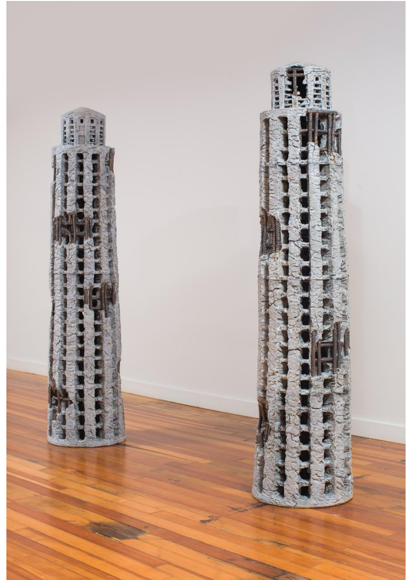
Hoover Dam Intake Towers, Ceramic Stoneware, PC-11, 2014