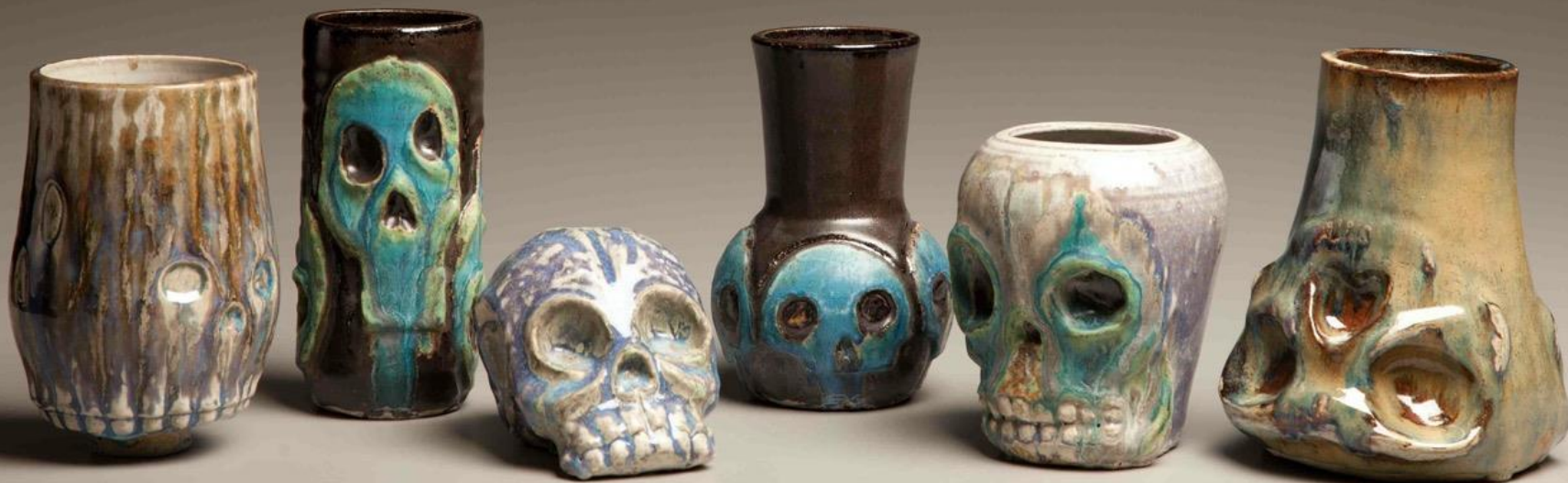
Intermediate Ceramics, Carved thrown forms wheel-thrown, white stoneware, Electric Cone 6, H: 8"