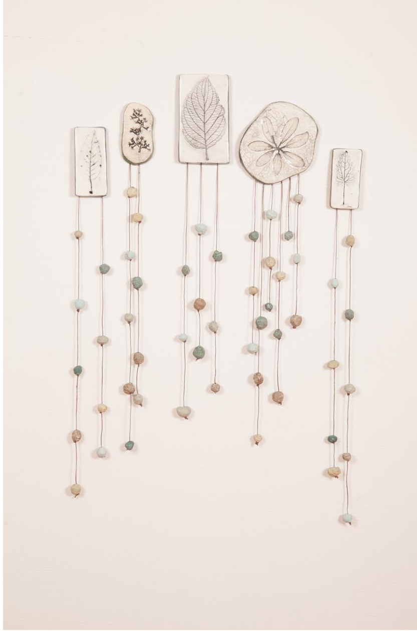
Intermediate Ceramics, Wall Mounted Sculptures hand-built, white stoneware, Electric Cone 6, H: 20"