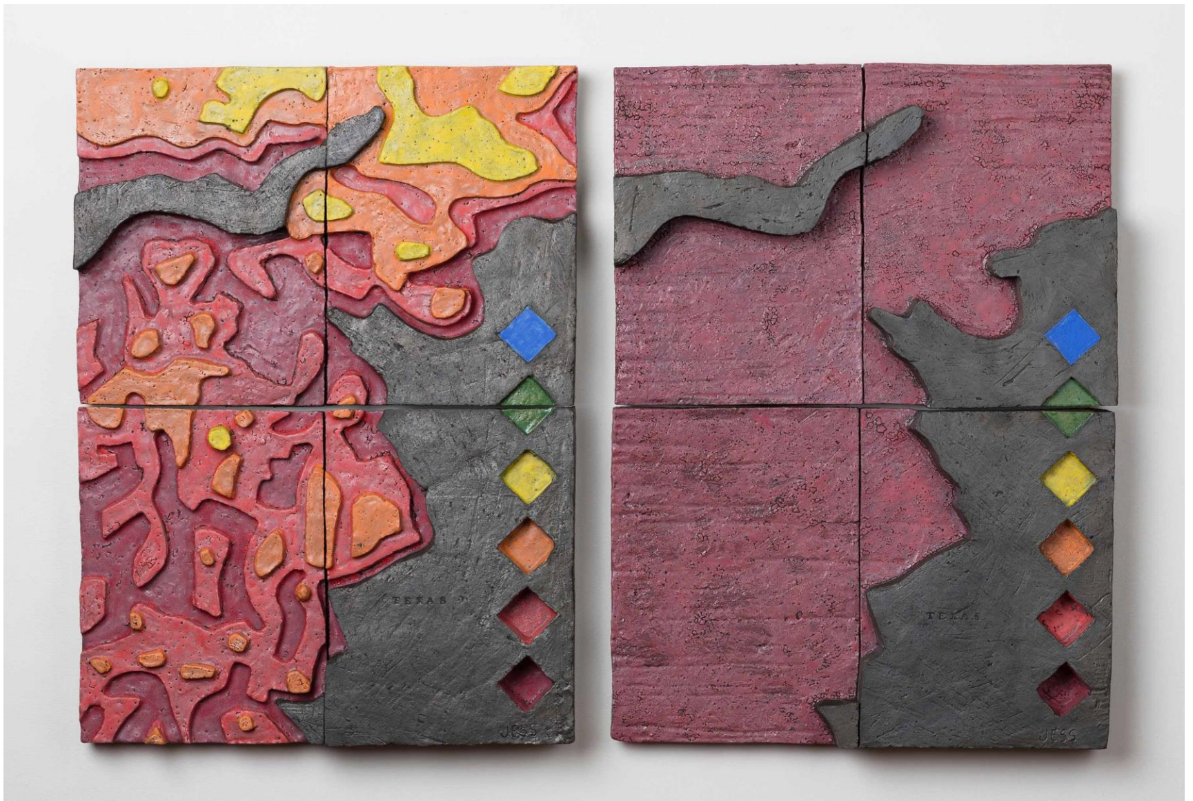
Dried Up On The Ogallala Aquifer (Southern High Plains), Ceramic Stoneware, plywood, vulkem, 27x42x2.75", 2020