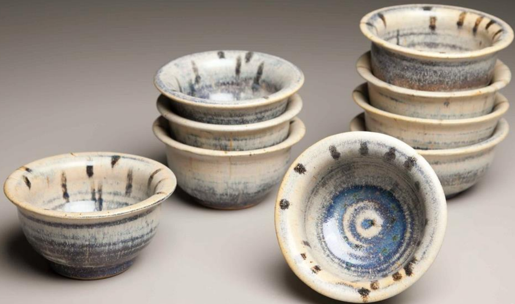
Beginning Ceramics, Stackable Bowls wheel-thrown stoneware, Gas Cone 10, 4x6"