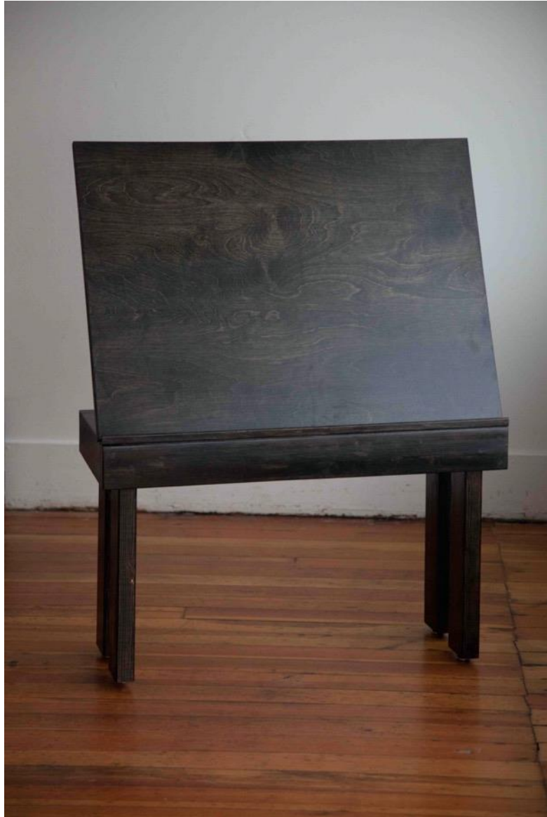
3-D Foundations, Drawing Table wood, stain, polyurethane, H: 42"