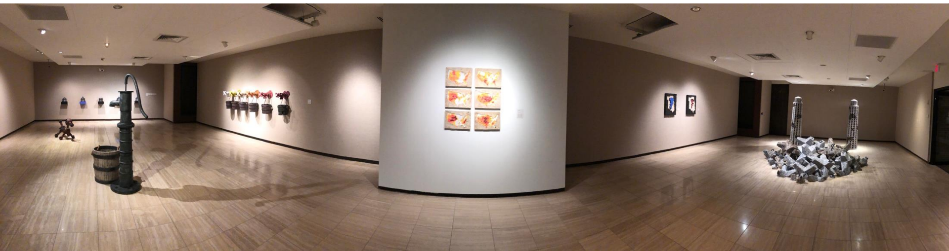
Precipice, Amarillo Museum of Art, 2021