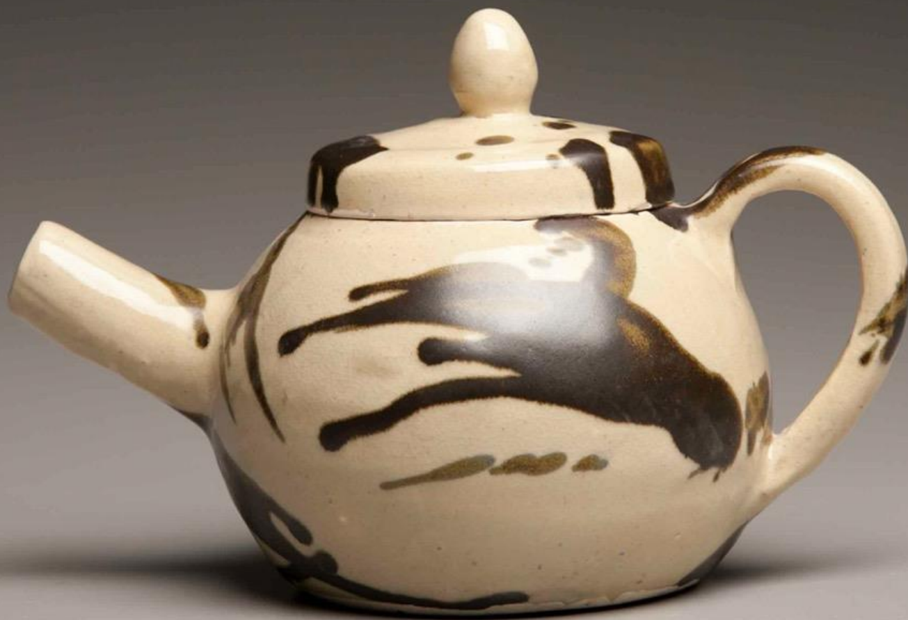
Intermediate Ceramics, Teapot wheel-thrown, white stoneware, Gas Cone 10, H: 7"