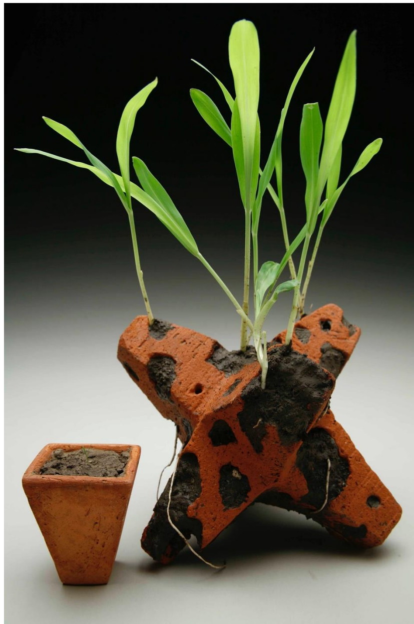
Paradox of Value, Terracotta, corn, dirt, little bluestem, water 5x5x10", 2008