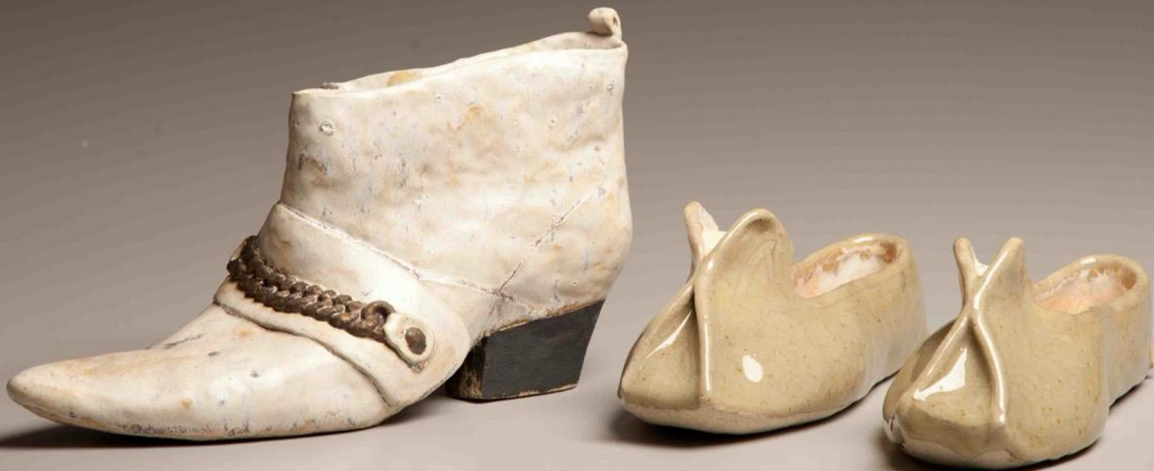
Beginning Ceramics, Found Object: Historical/Futuristic hand-built stoneware, Gas Cone 10, H: 9"