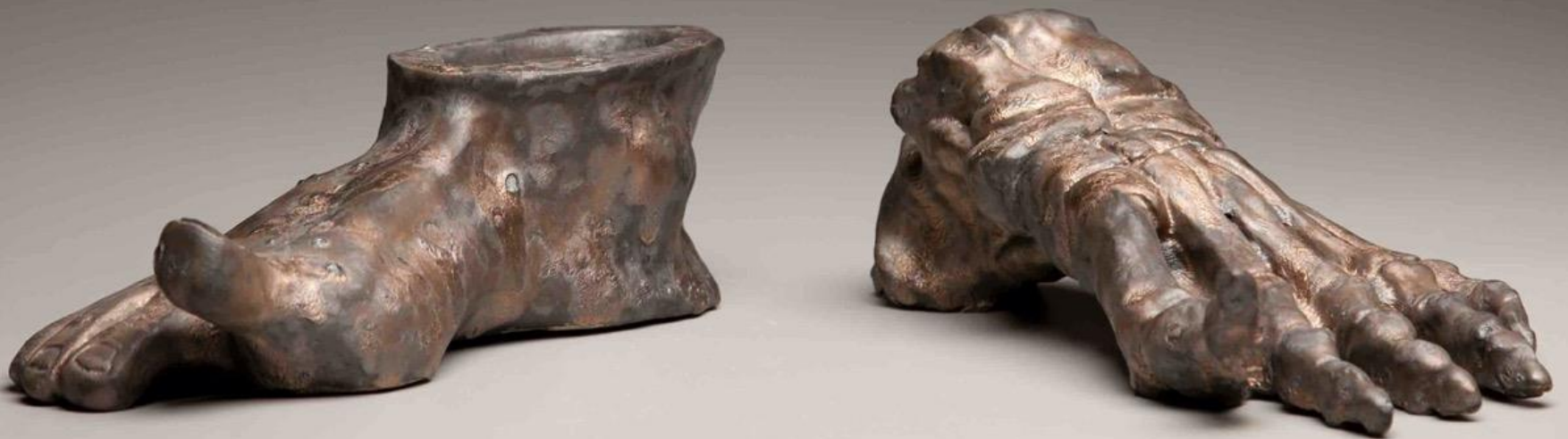
Beginning Ceramics, Found Object: Historical/Futuristic hand-built stoneware, Gas Cone 10, H: 6"